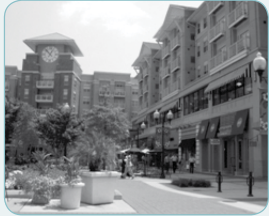
Example of a pedestrian precinct