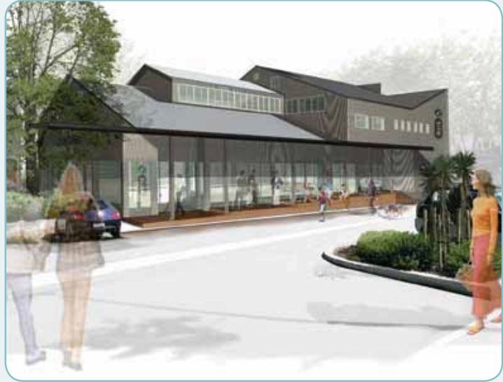
Architect's drawing of the new Visitor Information Centre at 31 Taupo Quay

heritage and creating an authentic and specifically Wanganui Visitor Centre experience.