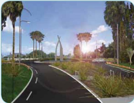
Artist's impression of the Southern Entranceway with the 'Encounter' sculpture by Mark Southcombe