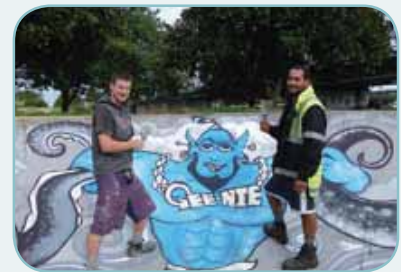
The graffiti team cleaning up the Kowhai Park skate park mural

The funding supports the Safer Wanganui initiative including graffiti and litter teams, CCTV, Community Patrols and Maori Wardens and the 'For our Kids' initiative.